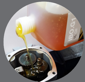
Oil lubricated gearbox