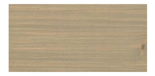
903 Basalt Grey