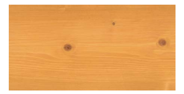
731 Oregon Pine