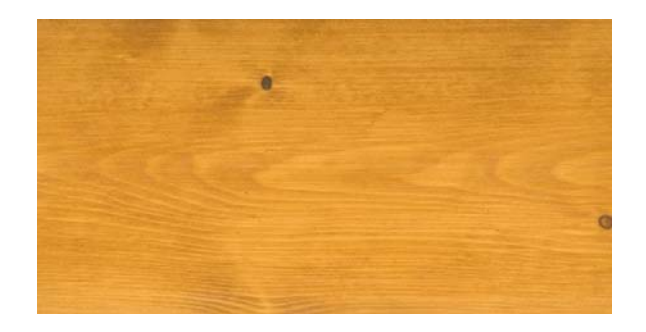
732 Light Oak